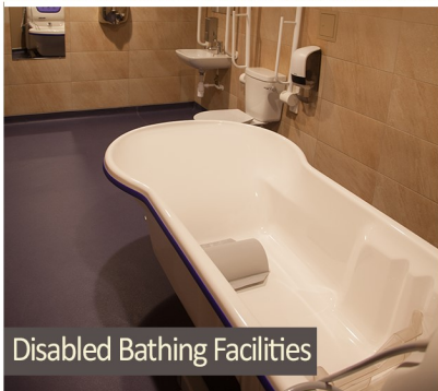
Disabled Bathing Facilities