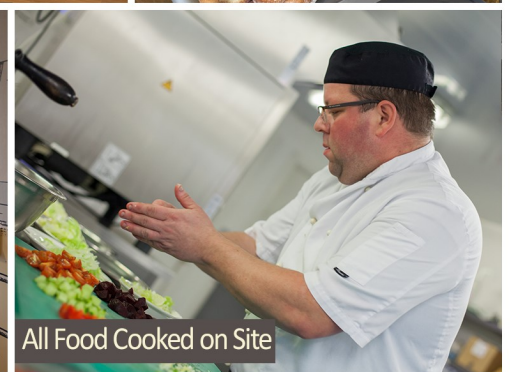
All Food Cooked on Site