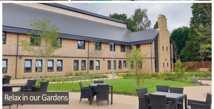
Relax in our Gardens

Main meals can be taken in the main Dining area, the Bistro area, the Lounge diners or in the resident's bedroom. We aim to protect mealtimes from unnecessary distractions such as medical appointments, however we welcome families who wish to support their relative with eating as we recognise that this can make mealtimes more enjoyable.