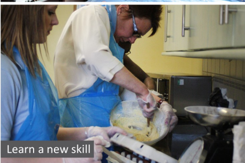
Learn a new skill